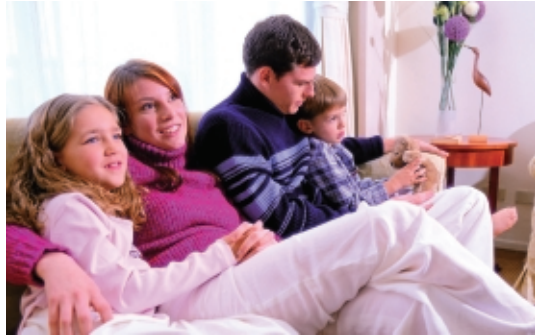
Specially designed for increased protection of children in their homes.

Your home wiring must meet basic safety standards to keep you and your family safe. ENERLITES's Tamper Resistant Receptacles are designed to prevent anything but a plug to be inserted into it keeping you and your family safe.